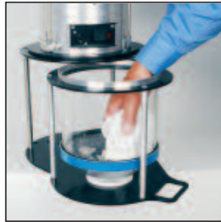
Slides out easily for access and cleaning