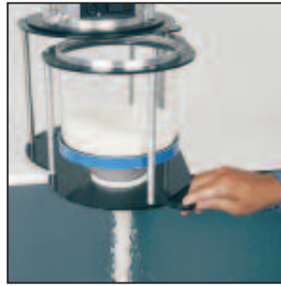
Slides off throat for instant draining