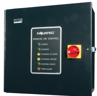
HB Controller box with temperature control.