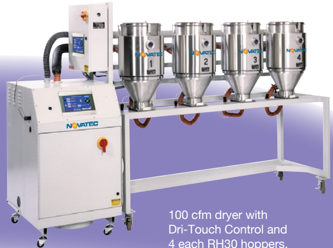
100 cfm dryer with Dri-Touch Control and 4 each RH30 hoppers.

Dry up to six different resins with different drying temperatures at one time with a single dryer...or dry colorants for blending at machine throat. Add a closed loop conveying system with a manifold and create a mini Central System.