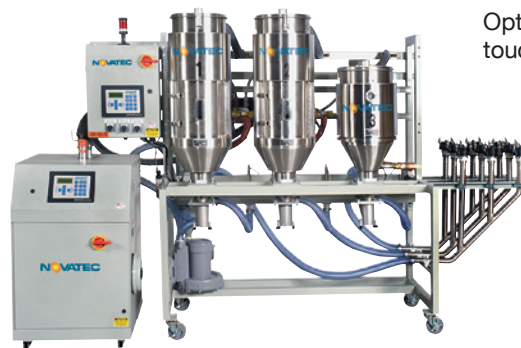
Multiple Hopper bank with conveyance to four machines utilizing standard ADC control.