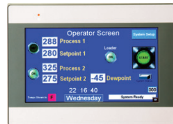
Optional Dri-Touch 7 inch color touch screen control.

To create mini central drying/conveying system.