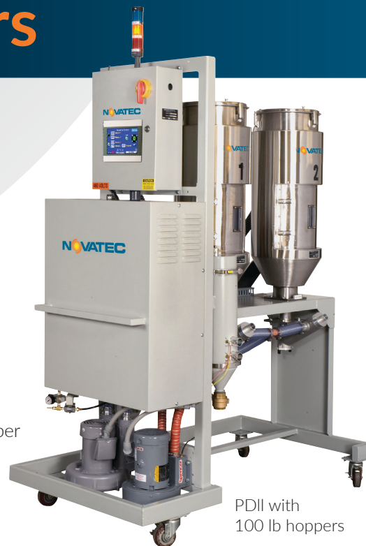
PDII with 100 lb hoppers