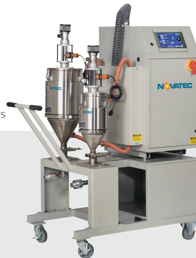
PDII with 5 & 15 lb hoppers