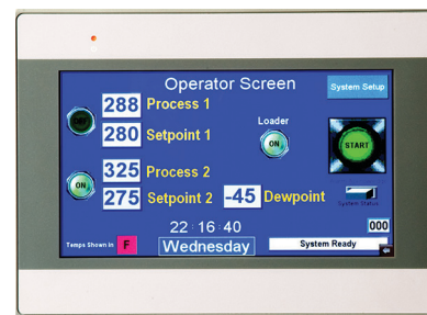
New Dri-Touch 7" color touch screen control