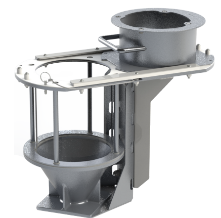
Sliding Base Receiver In Clean Out Mode