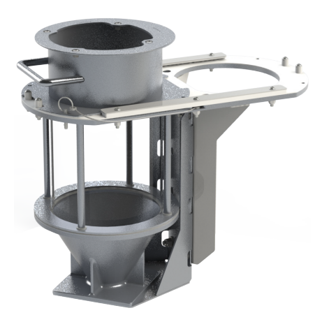
Sliding Base Receiver In Operation Mode