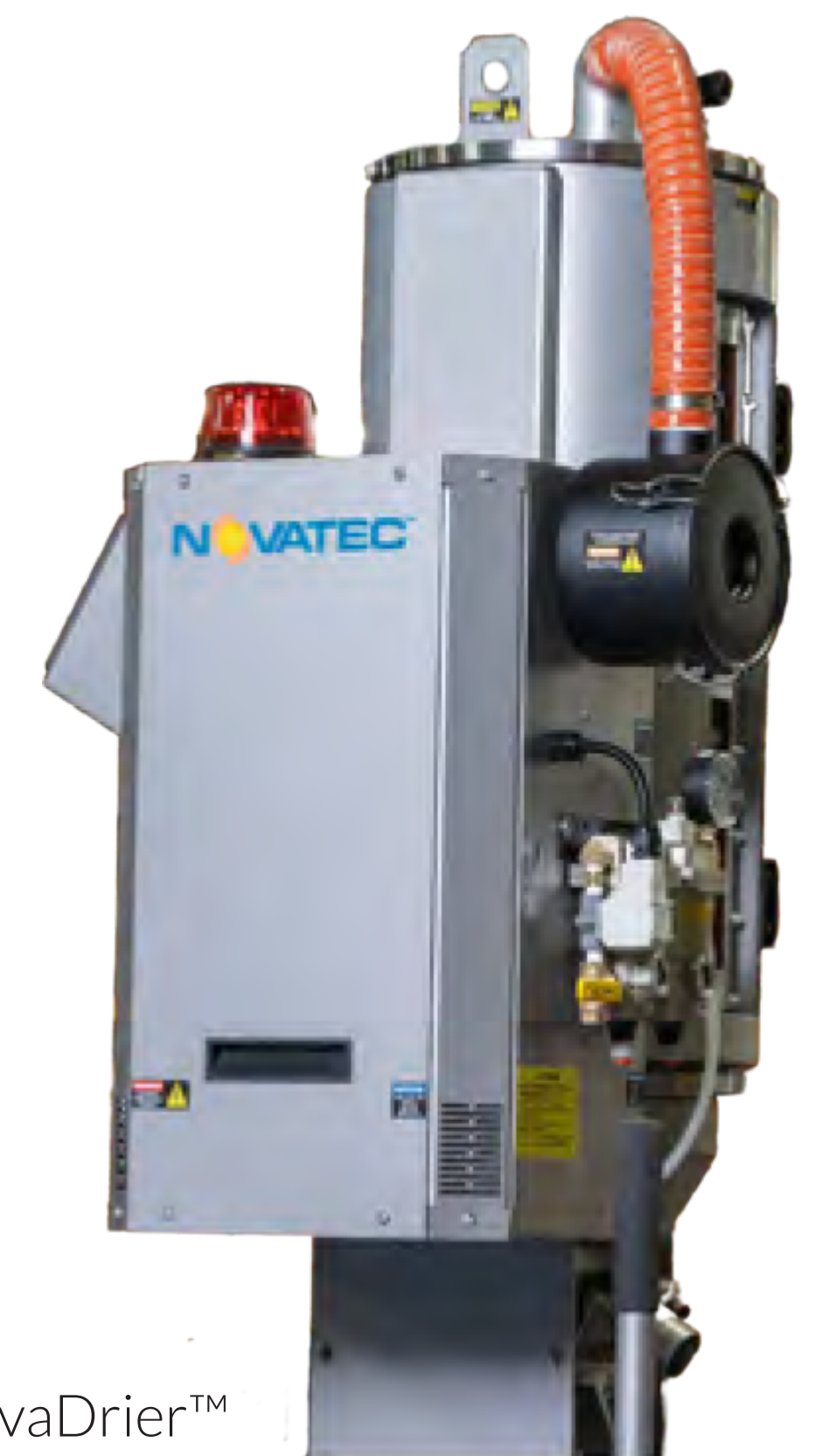
ND3-25 NovaDrier™ Showing new location of air filter.